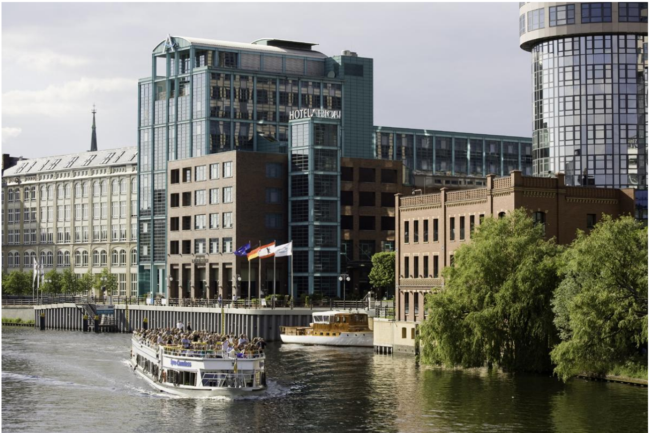
The Ameron ABION hotel (with boat trip)

http://www.hotel-insider-tip.tv/uploads/pics/Abion_Hotel_Villa_und_Aida_0633.jpg